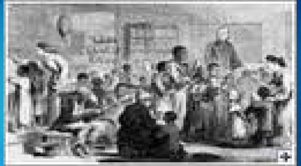
A school house during the Reconstruction era.